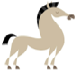
Misty River Ranch